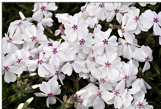
Amazing Grace Moss Phlox flowers