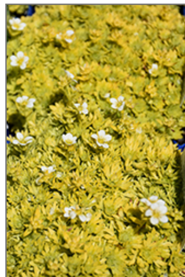
Cloth Of Gold Saxifrage flowers