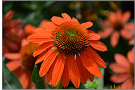
Sombrero Adobe Orange Coneflower flowers

Sombrero Adobe Orange Coneflower will grow to be about 24 inches tall at maturity, with a spread of 18 inches. Its foliage tends to remain dense right to the ground, not requiring facer plants in front. It grows at a medium rate, and under ideal conditions can be expected to live for approximately 10 years. As an herbaceous perennial, this plant will usually die back to the crown each winter, and will regrow from the base each spring. Be careful not to disturb the crown in late winter when it may not be readily seen!