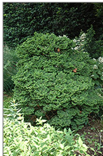
Koster's Falsecypress