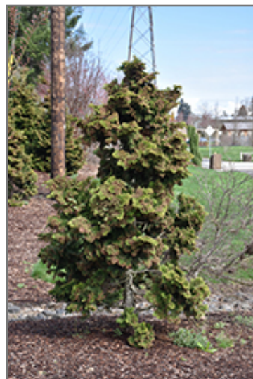
Koster's Falsecypress

Koster's Falsecypress makes a fine choice for the outdoor landscape, but it is also well-suited for use in outdoor pots and containers. Because of its height, it is often used as a 'thriller' in the 'spiller-thriller-filler' container combination; plant it near the center of the pot, surrounded by smaller plants and those that spill over the edges. It is even sizeable enough that it can be grown alone in a suitable container. Note that when grown in a container, it may not perform exactly as indicated on the tag - this is to be expected. Also note that when growing plants in outdoor containers and baskets, they may require more frequent waterings than they would in the yard or garden.