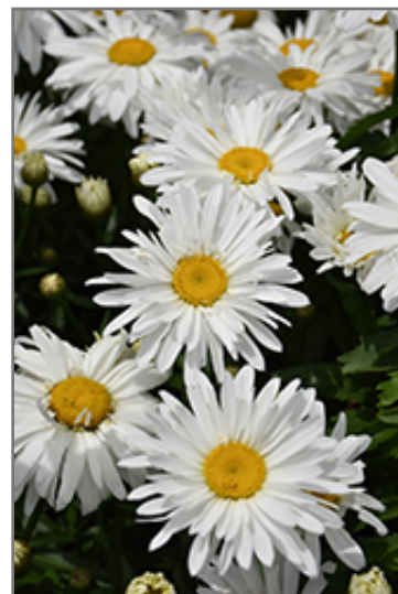
Whoops-A-Daisy Shasta Daisy flowers

Whoops-A-Daisy Shasta Daisy is recommended for the following landscape applications;