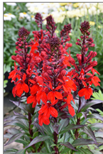
Starship Scarlet Lobelia flowers

Starship Scarlet Lobelia is recommended for the following landscape applications;