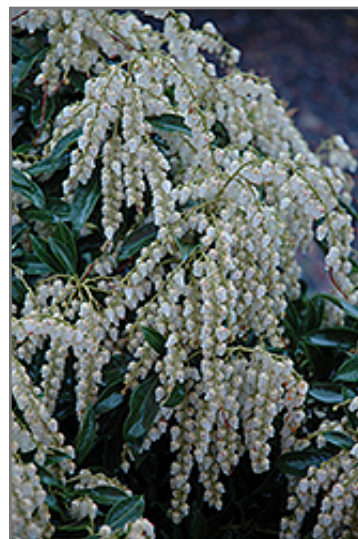
Compacta Japanese Pieris flowers