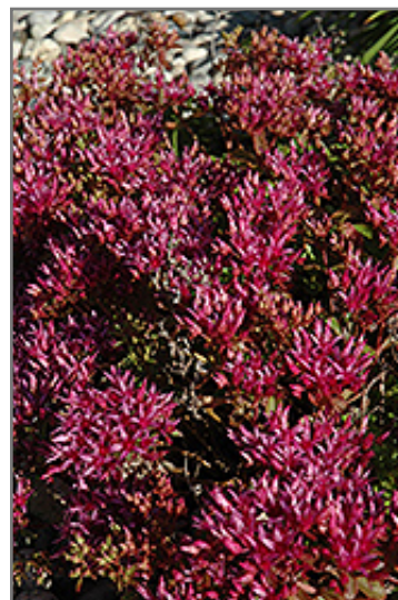
Dragon's Blood Stonecrop in bloom

Dragon's Blood Stonecrop is a fine choice for the garden, but it is also a good selection for planting in outdoor pots and containers. Because of its spreading habit of growth, it is ideally suited for use as a 'spiller' in the 'spiller-thriller-filler' container combination; plant it near the edges where it can spill gracefully over the pot. Note that when growing plants in outdoor containers and baskets, they may require more frequent waterings than they would in the yard or garden.