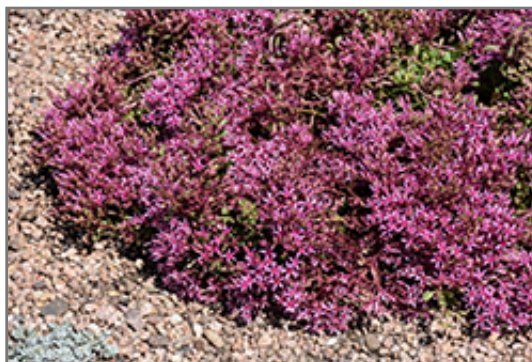
Dragon's Blood Stonecrop flowers

This plant will require occasional maintenance and upkeep, and is best cleaned up in early spring before it resumes active growth for the season. Deer don't particularly care for this plant and will usually leave it alone in favor of tastier treats. Gardeners should be aware of the following characteristic(s) that may warrant special consideration;