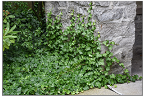
English Ivy

English Ivy makes a fine choice for the outdoor landscape, but it is also well-suited for use in outdoor pots and containers. Because of its spreading habit of growth, it is ideally suited for use as a 'spiller' in the 'spiller-thriller-filler' container combination; plant it near the edges where it can spill gracefully over the pot. Note that when grown in a container, it may not perform exactly as indicated on the tag - this is to be expected. Also note that when growing plants in outdoor containers and baskets, they may require more frequent waterings than they would in the yard or garden.