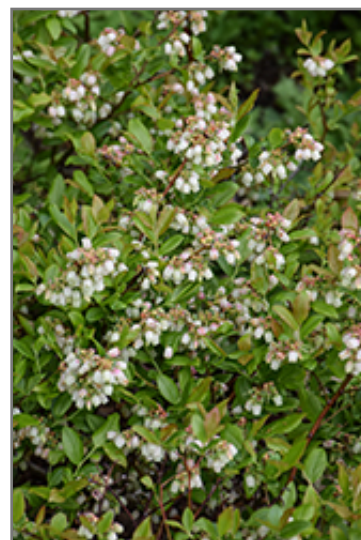
Lowbush Blueberry flowers