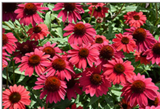
Sombrero Baja Burgundy Coneflower flowers

This is a relatively low maintenance plant, and is best cleaned up in early spring before it resumes active growth for the season. It is a good choice for attracting butterflies to your yard, but is not particularly attractive to deer who tend to leave it alone in favor of tastier treats. It has no significant negative characteristics.