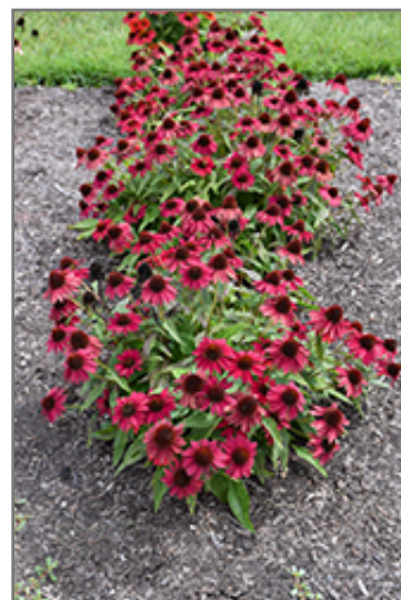
Sombrero Baja Burgundy Coneflower in bloom