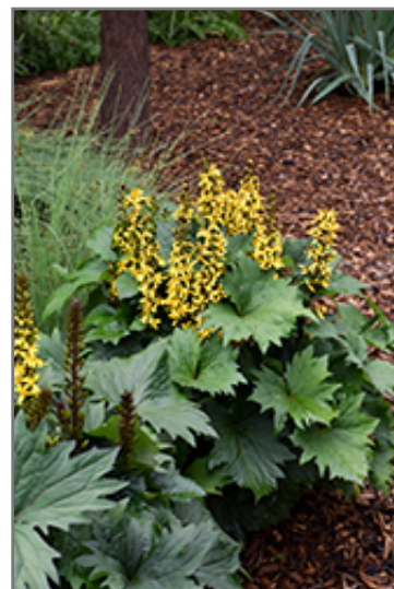
Bottle Rocket Rayflower in bloom