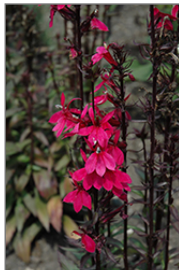
Starship Deep Rose Lobelia flowers

Starship Deep Rose Lobelia is recommended for the following landscape applications;