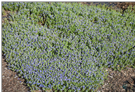
Tidal Pool Speedwell in bloom