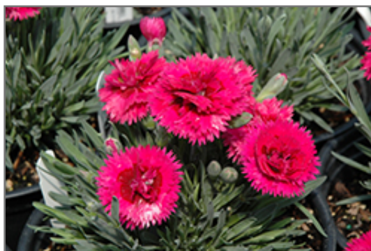
Starlette Pinks flowers