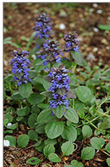
Caitlin's Giant Bugleweed flowers

Caitlin's Giant Bugleweed is recommended for the following landscape applications;