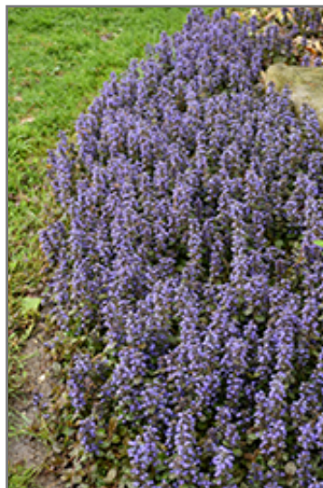
Caitlin's Giant Bugleweed