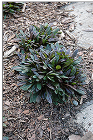
Chocolate Chip Bugleweed