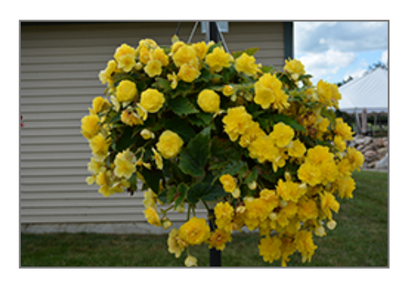
Nonstop Joy Yellow Begonia in bloom