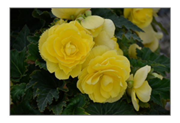
Nonstop Joy Yellow Begonia flowers