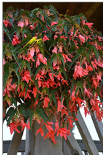
San Francisco Begonia in bloom