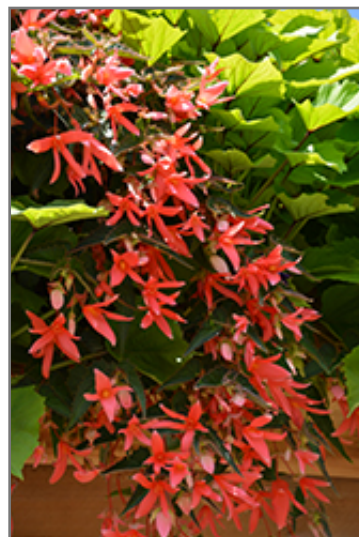
San Francisco Begonia flowers