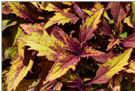
FlameThrower Spiced Curry Coleus foliage

FlameThrower Spiced Curry Coleus is recommended for the following landscape applications;