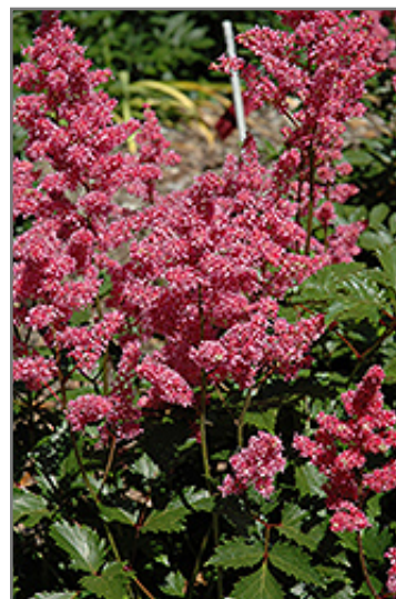
Rheinland Astilbe flowers

Rheinland Astilbe is recommended for the following landscape applications;