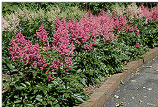
Rheinland Astilbe in bloom