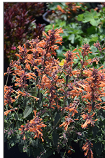
Kudos Mandarin Hyssop flowers