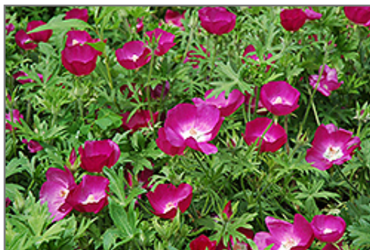
Buffalo Poppy flowers

Buffalo Poppy is recommended for the following landscape applications;