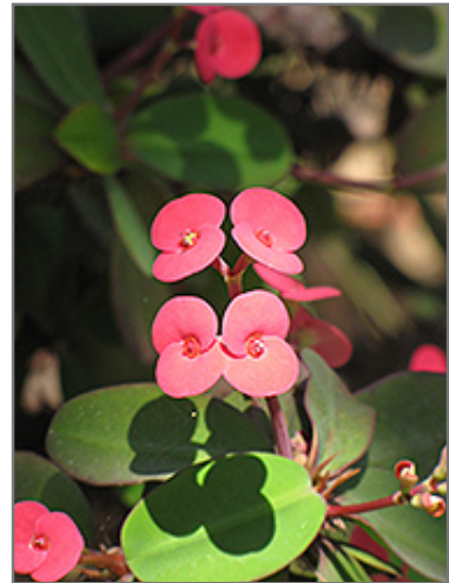
Crown Of Thorns flowers

This is a multi-stemmed evergreen houseplant with an upright spreading habit of growth. This plant may benefit from an occasional pruning to look its best.