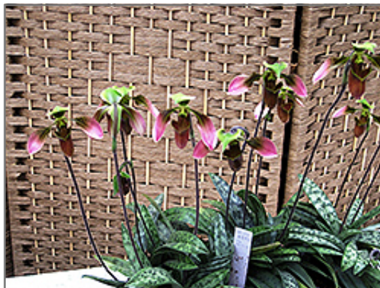
Appleton's Orchid in bloom