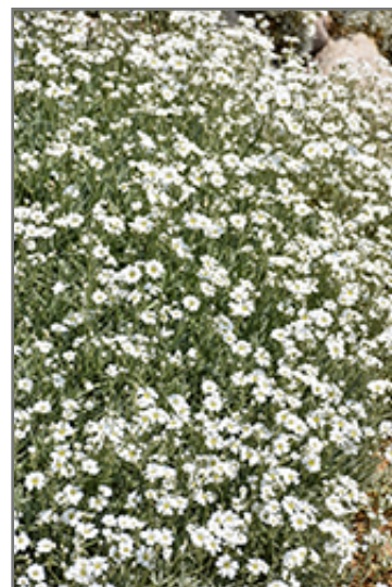
Snow-In-Summer in bloom