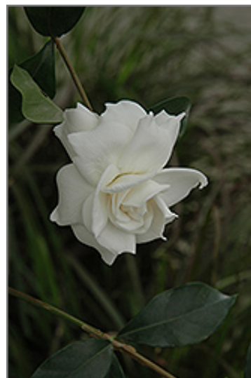
First Love Gardenia flowers

There are many factors that will affect the ultimate height, spread and overall performance of a plant when grown indoors; among them, the size of the pot it's growing in, the amount of light it receives, watering frequency, the pruning regimen and repotting schedule. Use the information described here as a guideline only; individual performance can and will vary. Please contact the store to speak with one of our experts if you are interested in further details concerning recommendations on pot size, watering, pruning, repotting, etc.