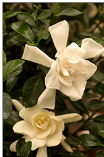
August Beauty Gardenia flowers

There are many factors that will affect the ultimate height, spread and overall performance of a plant when grown indoors; among them, the size of the pot it's growing in, the amount of light it receives, watering frequency, the pruning regimen and repotting schedule. Use the information described here as a guideline only; individual performance can and will vary. Please contact the store to speak with one of our experts if you are interested in further details concerning recommendations on pot size, watering, pruning, repotting, etc.