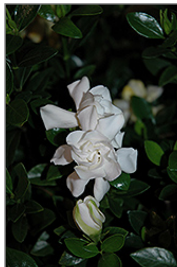
Jubilation Gardenia flowers

When grown indoors, Jubilation Gardenia can be expected to grow to be about 4 feet tall at maturity, with a spread of 3 feet. It grows at a medium rate, and under ideal conditions can be expected to live for approximately 30 years. This houseplant will do well in a location that gets either direct or indirect sunlight, although it will usually require a more brightly-lit environment than what artificial indoor lighting alone can provide. It does best in average to evenly moist soil, but will not tolerate standing water. The surface of the soil shouldn't be allowed to dry out completely, and so you should expect to water this plant once and possibly even twice each week. Be aware that your particular watering schedule may vary depending on its location in the room, the pot size, plant size and other conditions; if in doubt, ask one of our experts in the store for advice. It is not particular as to soil pH, but grows best in rich soil. Contact the store for specific recommendations on pre-mixed potting soil for this plant.