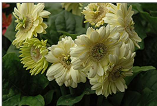
Cream Gerbera Daisy flowers

When grown indoors, Cream Gerbera Daisy can be expected to grow to be about 12 inches tall at maturity extending to 16 inches tall with the flowers, with a spread of 12 inches. It grows at a fast rate, and under ideal conditions can be expected to live for approximately 3 years. This houseplant will do well in a location that gets either direct or indirect sunlight, although it will usually require a more brightly-lit environment than what artificial indoor lighting alone can provide. It does best in average to evenly moist soil, but will not tolerate standing water. The surface of the soil shouldn't be allowed to dry out completely, and so you should expect to water this plant once and possibly even twice each week. Be aware that your particular watering schedule may vary depending on its location in the room, the pot size, plant size and other conditions; if in doubt, ask one of our experts in the store for advice. It is not particular as to soil type or pH; an average potting soil should work just fine.