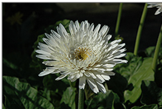
Funtastic Blush Gerbera Daisy flowers

When grown indoors, Funtastic Blush Gerbera Daisy can be expected to grow to be about 16 inches tall at maturity, with a spread of 14 inches. It grows at a fast rate, and under ideal conditions can be expected to live for approximately 3 years. This houseplant will do well in a location that gets either direct or indirect sunlight, although it will usually require a more brightly-lit environment than what artificial indoor lighting alone can provide. It does best in average to evenly moist soil, but will not tolerate standing water. The surface of the soil shouldn't be allowed to dry out completely, and so you should expect to water this plant once and possibly even twice each week. Be aware that your particular watering schedule may vary depending on its location in the room, the pot size, plant size and other conditions; if in doubt, ask one of our experts in the store for advice. It is not particular as to soil type or pH; an average potting soil should work just fine.