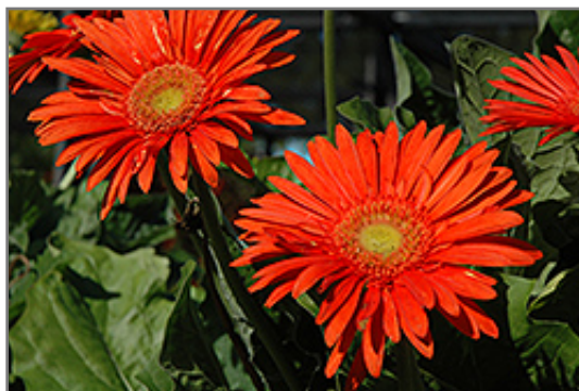
Funtastic Fire Orange Gerbera Daisy flowers

When grown indoors, Funtastic Fire Orange Gerbera Daisy can be expected to grow to be about 16 inches tall at maturity, with a spread of 14 inches. It grows at a fast rate, and under ideal conditions can be expected to live for approximately 3 years. This houseplant will do well in a location that gets either direct or indirect sunlight, although it will usually require a more brightly-lit environment than what artificial indoor lighting alone can provide. It does best in average to evenly moist soil, but will not tolerate standing water. The surface of the soil shouldn't be allowed to dry out completely, and so you should expect to water this plant once and possibly even twice each week. Be aware that your particular watering schedule may vary depending on its location in the room, the pot size, plant size and other conditions; if in doubt, ask one of our experts in the store for advice. It is not particular as to soil type or pH; an average potting soil should work just fine.