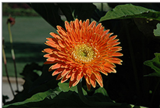
Funtastic Mango Gerbera Daisy flowers

When grown indoors, Funtastic Mango Gerbera Daisy can be expected to grow to be about 16 inches tall at maturity, with a spread of 14 inches. It grows at a fast rate, and under ideal conditions can be expected to live for approximately 3 years. This houseplant will do well in a location that gets either direct or indirect sunlight, although it will usually require a more brightly-lit environment than what artificial indoor lighting alone can provide. It does best in average to evenly moist soil, but will not tolerate standing water. The surface of the soil shouldn't be allowed to dry out completely, and so you should expect to water this plant once and possibly even twice each week. Be aware that your particular watering schedule may vary depending on its location in the room, the pot size, plant size and other conditions; if in doubt, ask one of our experts in the store for advice. It is not particular as to soil type or pH; an average potting soil should work just fine.