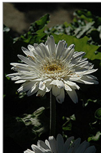
Funtastic White Gerbera Daisy flowers

When grown indoors, Funtastic White Gerbera Daisy can be expected to grow to be about 16 inches tall at maturity, with a spread of 14 inches. It grows at a fast rate, and under ideal conditions can be expected to live for approximately 3 years. This houseplant will do well in a location that gets either direct or indirect sunlight, although it will usually require a more brightly-lit environment than what artificial indoor lighting alone can provide. It does best in average to evenly moist soil, but will not tolerate standing water. The surface of the soil shouldn't be allowed to dry out completely, and so you should expect to water this plant once and possibly even twice each week. Be aware that your particular watering schedule may vary depending on its location in the room, the pot size, plant size and other conditions; if in doubt, ask one of our experts in the store for advice. It is not particular as to soil type or pH; an average potting soil should work just fine.