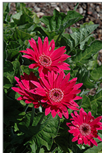
Garvinea Sweet Dreams Gerbera Daisy flowers

When grown indoors, Garvinea Sweet Dreams Gerbera Daisy can be expected to grow to be about 16 inches tall at maturity, with a spread of 18 inches. It grows at a fast rate, and under ideal conditions can be expected to live for approximately 3 years. This houseplant will do well in a location that gets either direct or indirect sunlight, although it will usually require a more brightly-lit environment than what artificial indoor lighting alone can provide. It does best in average to evenly moist soil, but will not tolerate standing water. The surface of the soil shouldn't be allowed to dry out completely, and so you should expect to water this plant once and possibly even twice each week. Be aware that your particular watering schedule may vary depending on its location in the room, the pot size, plant size and other conditions; if in doubt, ask one of our experts in the store for advice. It is not particular as to soil type or pH; an average potting soil should work just fine.