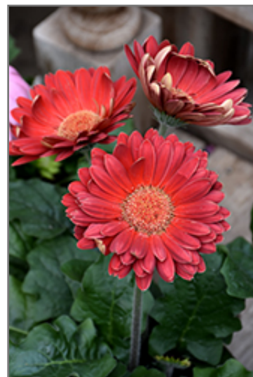
Red Gerbera Daisy flowers

Elegant red daisies with yellow centers rise above sea green foliage on this upright variety; perfect for garden beds, borders and containers; excellent in cut-flower arrangements; adaptable as a houseplant