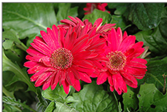
Royal Deep Rose Gerbera Daisy flowers

When grown indoors, Royal Deep Rose Gerbera Daisy can be expected to grow to be about 8 inches tall at maturity extending to 12 inches tall with the flowers, with a spread of 8 inches. It grows at a fast rate, and under ideal conditions can be expected to live for approximately 3 years. This houseplant will do well in a location that gets either direct or indirect sunlight, although it will usually require a more brightly-lit environment than what artificial indoor lighting alone can provide. It does best in average to evenly moist soil, but will not tolerate standing water. The surface of the soil shouldn't be allowed to dry out completely, and so you should expect to water this plant once and possibly even twice each week. Be aware that your particular watering schedule may vary depending on its location in the room, the pot size, plant size and other conditions; if in doubt, ask one of our experts in the store for advice. It is not particular as to soil type or pH; an average potting soil should work just fine.