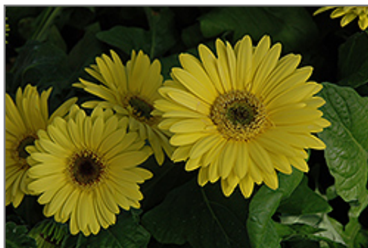
Royal Yellow Gerbera Daisy flowers

When grown indoors, Royal Yellow Gerbera Daisy can be expected to grow to be about 8 inches tall at maturity extending to 12 inches tall with the flowers, with a spread of 8 inches. It grows at a fast rate, and under ideal conditions can be expected to live for approximately 3 years. This houseplant will do well in a location that gets either direct or indirect sunlight, although it will usually require a more brightly-lit environment than what artificial indoor lighting alone can provide. It does best in average to evenly moist soil, but will not tolerate standing water. The surface of the soil shouldn't be allowed to dry out completely, and so you should expect to water this plant once and possibly even twice each week. Be aware that your particular watering schedule may vary depending on its location in the room, the pot size, plant size and other conditions; if in doubt, ask one of our experts in the store for advice. It is not particular as to soil type or pH; an average potting soil should work just fine.