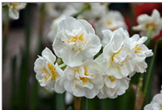
Bridal Crown Daffodil flowers

When grown indoors, Bridal Crown Daffodil can be expected to grow to be about 14 inches tall at maturity, with a spread of 14 inches. It grows at a medium rate, and under ideal conditions can be expected to live for approximately 10 years. This houseplant will do well in a location that gets either direct or indirect sunlight, although it will usually require a more brightly-lit environment than what artificial indoor lighting alone can provide. It does best in average to evenly moist soil, but will not tolerate standing water. The surface of the soil shouldn't be allowed to dry out completely, and so you should expect to water this plant once and possibly even twice each week. Be aware that your particular watering schedule may vary depending on its location in the room, the pot size, plant size and other conditions; if in doubt, ask one of our experts in the store for advice. It is not particular as to soil type or pH; an average potting soil should work just fine.