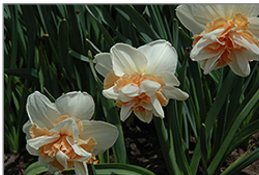
Delnashaugh Daffodil flowers

When grown indoors, Delnashaugh Daffodil can be expected to grow to be about 14 inches tall at maturity, with a spread of 14 inches. It grows at a medium rate, and under ideal conditions can be expected to live for approximately 10 years. This houseplant will do well in a location that gets either direct or indirect sunlight, although it will usually require a more brightly-lit environment than what artificial indoor lighting alone can provide. It does best in average to evenly moist soil, but will not tolerate standing water. The surface of the soil shouldn't be allowed to dry out completely, and so you should expect to water this plant once and possibly even twice each week. Be aware that your particular watering schedule may vary depending on its location in the room, the pot size, plant size and other conditions; if in doubt, ask one of our experts in the store for advice. It is not particular as to soil type or pH; an average potting soil should work just fine.