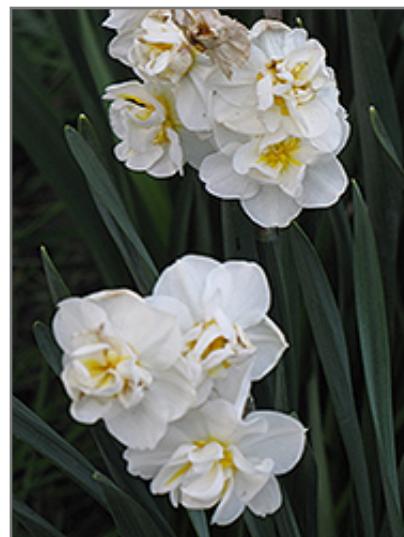
Cheerfulness Daffodil flowers

When grown indoors, Cheerfulness Daffodil can be expected to grow to be about 14 inches tall at maturity, with a spread of 12 inches. It grows at a medium rate, and under ideal conditions can be expected to live for approximately 10 years. This houseplant will do well in a location that gets either direct or indirect sunlight, although it will usually require a more brightly-lit environment than what artificial indoor lighting alone can provide. It does best in average to evenly moist soil, but will not tolerate standing water. The surface of the soil shouldn't be allowed to dry out completely, and so you should expect to water this plant once and possibly even twice each week. Be aware that your particular watering schedule may vary depending on its location in the room, the pot size, plant size and other conditions; if in doubt, ask one of our experts in the store for advice. It is not particular as to soil type or pH; an average potting soil should work just fine.