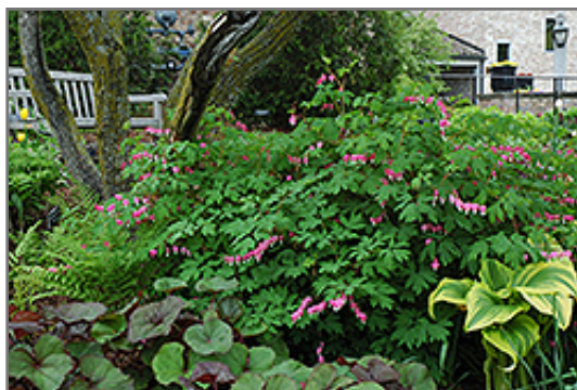
Common Bleeding Heart in bloom