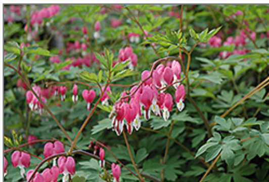
Common Bleeding Heart flowers

Common Bleeding Heart is recommended for the following landscape applications;