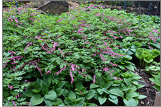
Common Bleeding Heart in bloom

Common Bleeding Heart will grow to be about 3 feet tall at maturity, with a spread of 3 feet. When grown in masses or used as a bedding plant, individual plants should be spaced approximately 30 inches apart. It grows at a medium rate, and under ideal conditions can be expected to live for approximately 15 years. As an herbaceous perennial, this plant will usually die back to the crown each winter, and will regrow from the base each spring. Be careful not to disturb the crown in late winter when it may not be readily seen! As this plant tends to go dormant in summer, it is best interplanted with late-season bloomers to hide the dying foliage.