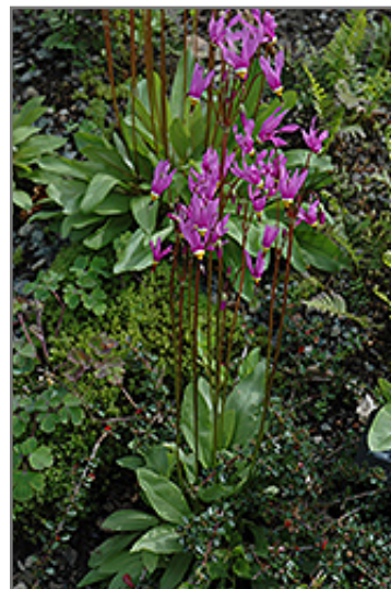
Shooting Star in bloom