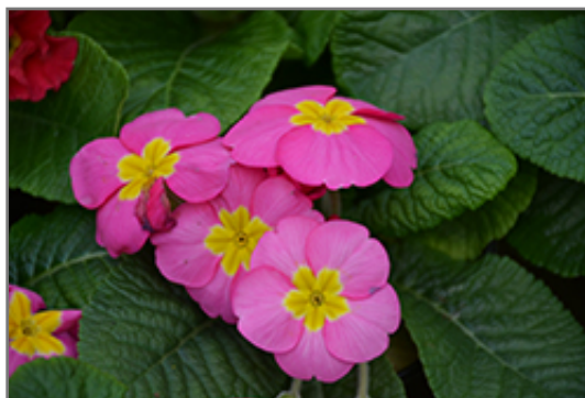
Orion Pink Primrose flowers

When grown indoors, Orion Pink Primrose can be expected to grow to be only 5 inches tall at maturity, with a spread of 8 inches. It grows at a fast rate, and under ideal conditions can be expected to live for approximately 5 years. This houseplant performs well in both bright or indirect sunlight and strong artificial light, and can therefore be situated in almost any well-lit room or location. It requires an evenly moist well-drained soil for optimal growth, but will suffer if left to grow in standing water. The surface of the soil shouldn't be allowed to dry out completely, and so you should expect to water this plant once and possibly even twice each week. Be aware that your particular watering schedule may vary depending on its location in the room, the pot size, plant size and other conditions; if in doubt, ask one of our experts in the store for advice. It is not particular as to soil type or pH; an average potting soil should work just fine.