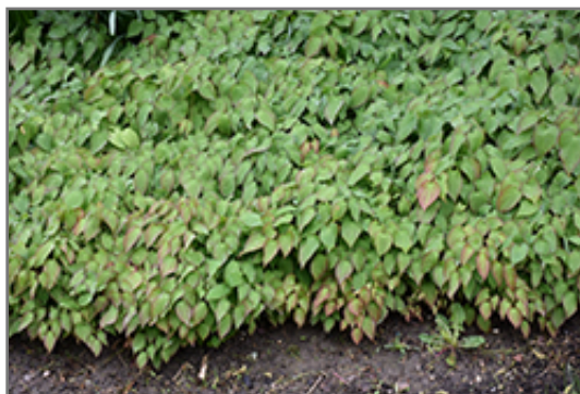
Bishop's Hat