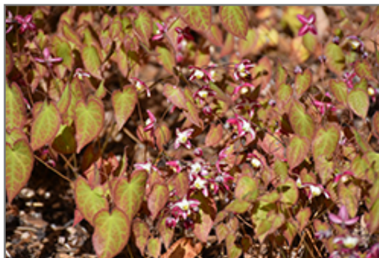
Bishop's Hat in bloom