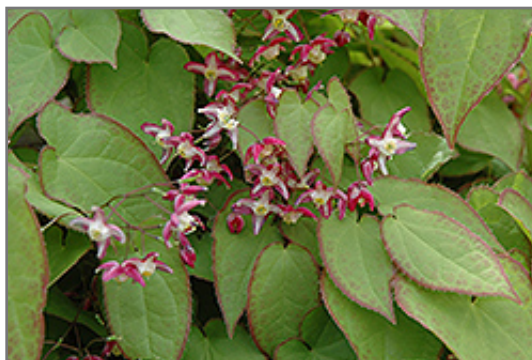
Bishop's Hat flowers

Bishop's Hat is a dense herbaceous evergreen perennial with a ground-hugging habit of growth. Its relatively fine texture sets it apart from other garden plants with less refined foliage.