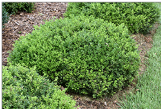
Tide Hill Boxwood