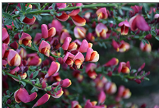
Burkwood's Broom flowers