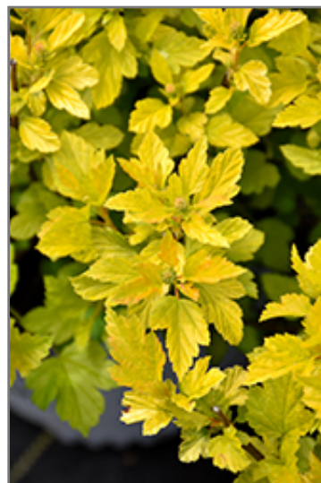
Tiny Wine Gold Ninebark foliage

Tiny Wine Gold Ninebark is recommended for the following landscape applications;