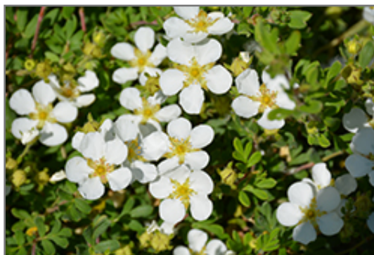
Happy Face White Potentilla flowers