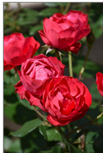
Oso Easy Double Red Rose flowers

Oso Easy Double Red Rose is recommended for the following landscape applications;